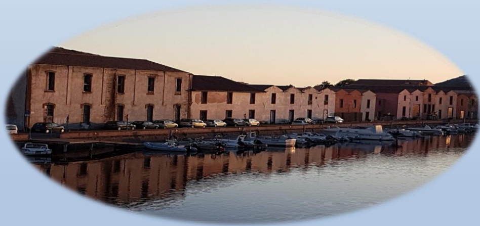
Bosa Tanneries – UNESCO Patrimony